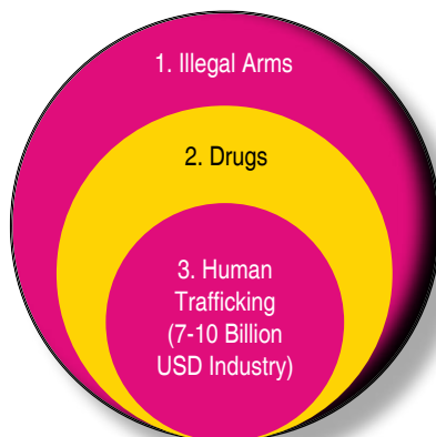
Largest Global Criminal Activities

The number of child victims trafficked worldwide for sexual exploitation or cheap labour on an annual basis is 1.2 million. 1 Human trafficking, the third largest international crime, following illegal drugs and arms trafficking, is believed to be worth billions of dollars each year. Driving the trade is the demand for commercial sexual exploitation. Seventy-nine percent of all global trafficking is for sexual exploitation. 2