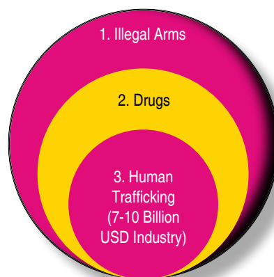
Largest Global Criminal Activities

The number of child victims trafficked worldwide for sexual exploitation or cheap labour on an annual basis is 1.2 million. 1 Human trafficking, the third largest international crime, following illegal drugs and arms trafficking, is believed to be worth billions of dollars each year. Driving the trade is the demand for commercial sexual exploitation. Seventy-nine percent of all global trafficking is for sexual exploitation. 2